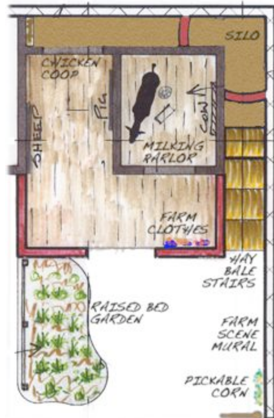
Top-down sketch of the new Sustainable Farming Exhibit. See additional views and download files at www.childrensmet.org .

Special Earth Week Gift Bags will also be available to program participants, and to members and paying families coming to see the new exhibit on Earth Day and the following Saturday and Sunday, April 26–27 (while supplies last). Packaged in a stylish, ultra-compact ChicoBag reusable shopping bag provided by Stonyfield, these will include donations by various Earth-minded firms, including organic snacks from Annie's Homegrown; Recycline Preserve Jr® toothbrushes made from recycled Stonyfield yogurt cups; Earth-friendly cleaners from Seventh Generation; discount coupons, seeds, and activity kits from Stonyfield Farm; and a variety of fun stickers, magnets, and other organic farming themed material. Special premiums will also be available for families purchasing a new or renewed Membership during Earth Week.